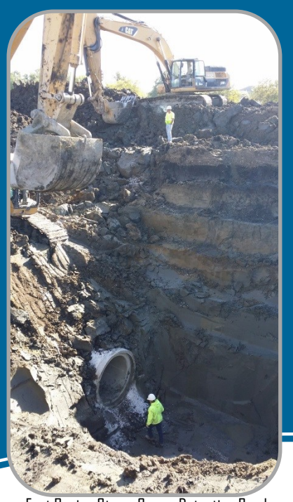
East Region Storm Sewer Detention Pond